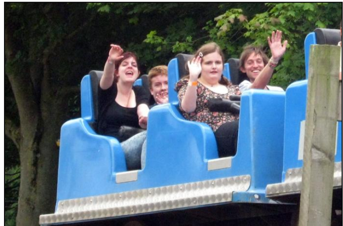
Light Water Valley, Thursday 19 th August 2010