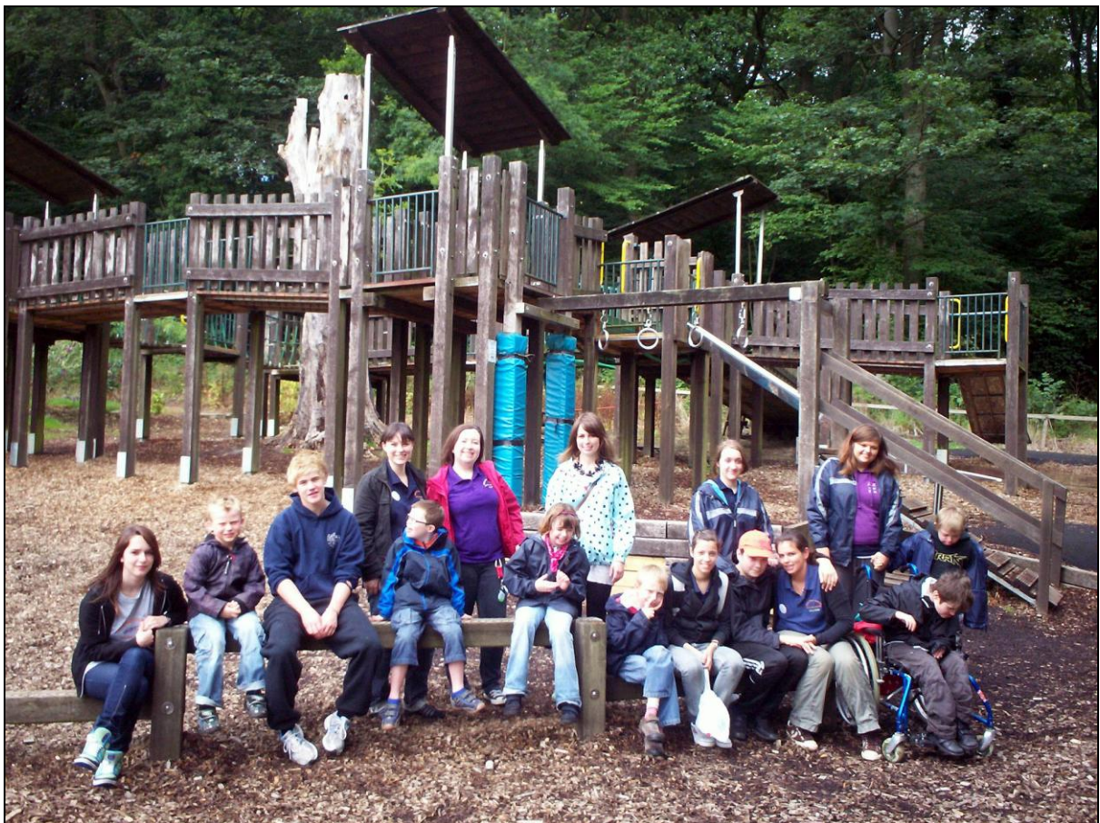
Nell Bank Outdoor Centre, Ilkley