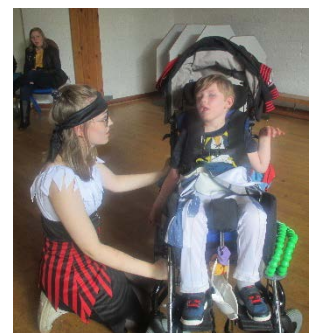
Buzz Lightyear & Captain Hook

As usual we will have our end of scheme party on Friday 11 August from 1pm, all scheme participants are welcome to attend however if they aren't booked in for that date then they can still attend but someone will need to stay with them. The theme is yet to be decided - your ideas would be very much appreciated, we do understand not all children like to dress up so this is optional.