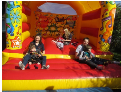
Fun on the bouncy castle