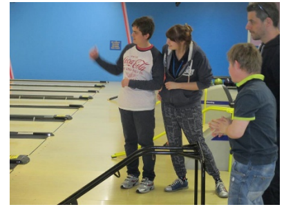
Bowling at Shipley Lanes